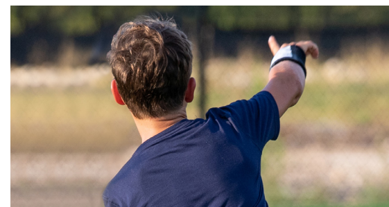
Speaking of Prevention