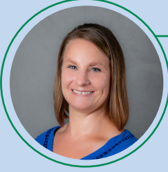
Sarah Huling Commissioner