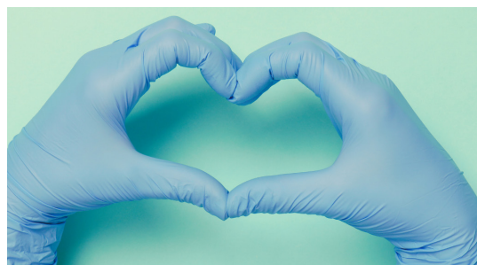
Cover Story: Levels of Care